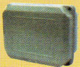
Panel Box (ABS)

IP is also designed to be powered with emergency batteries that can be incorporated into the automation system.